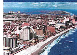
The spectacular Atlantic Ocean Shore

Departure: Walmart, 10772 W. Carson City Rd, Greenville, MI @ 8 am