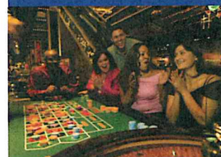
World-class gaming in Atlantic City awaits!